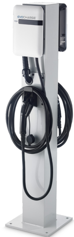
Dual port 6-inch concealed pedestal

* For hardwired input circuit connection, input plug can simply be removed by a certified electrician during installation.