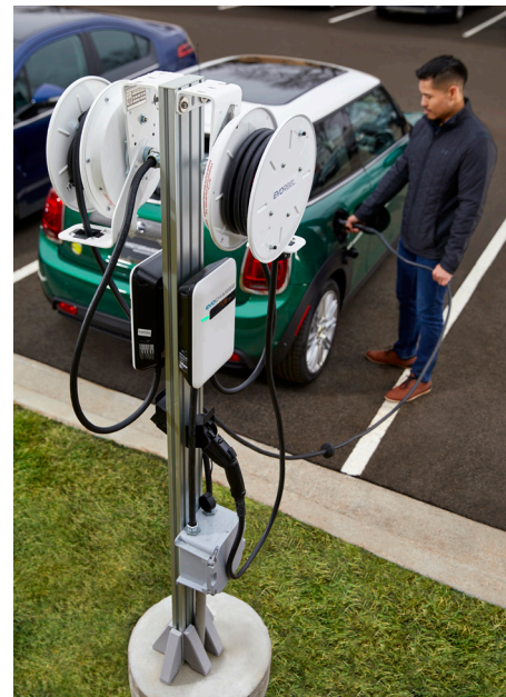
Dual port with EvoReels on channel pedestal