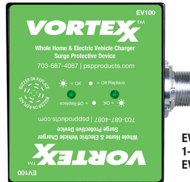
EV100 1-Phase EV Charger SPD