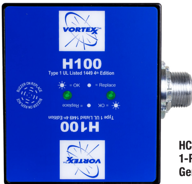
HC1C100-06N 1-Phase General Purpose SPD